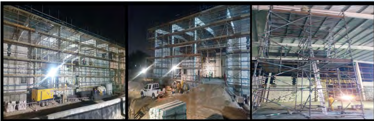
Project: Construction of Proposed Qatar Logistics Building Client: Mannai Trading Company Location: Road 24, Industrial Area