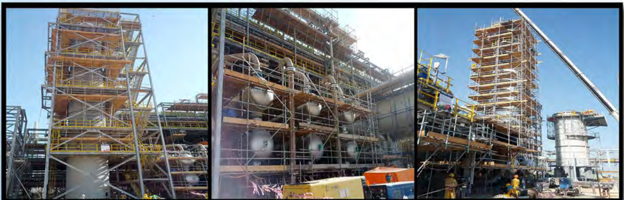
Project: Laffan Refinery DHT Project Client: QatarGas Operating Co. / Samsung Engineering Location: Ras Laffan Industrial City