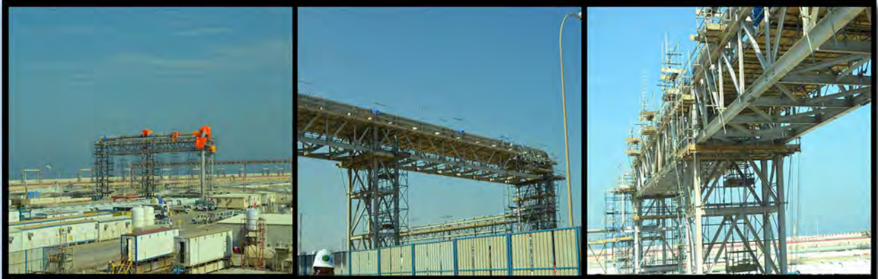
Project: Jetty Boil Off Gas Project Client: QatarGas Operating Co. Ltd. Location: Ras Laffan Industrial City