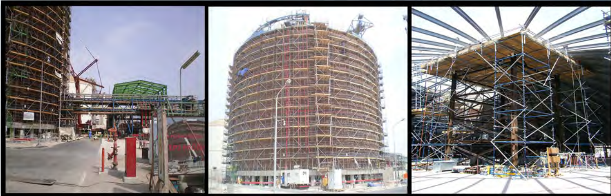
Project: QAPCO EP3 Project (New Furnace and Ethylene Tank) Client: QAPCO / CTCI Overseas Corp. Ltd, Location: Mesaieed Industrial City