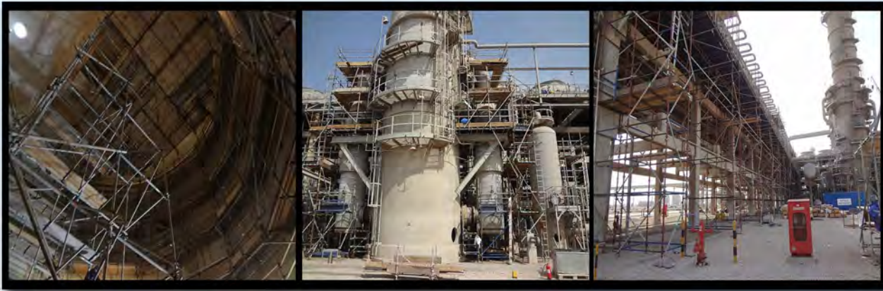
Project: QAFAC Shutdown 2014 Client: Qatar Fuel Additives Co. Location: Mesaieed Industrial City