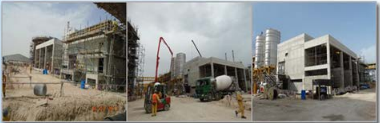
Project: EPC for Industrial Water Management Project (IWMP) Client: Dolphin Energy LTD Location: Ras Laffan Industrial Area