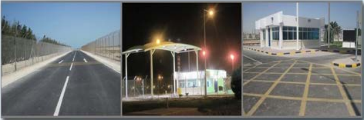
Project: EPIC of New Access Road, Guardhouses & Other Facilities Client: Oryx GTL Location: Ras Laffan Industrial Area