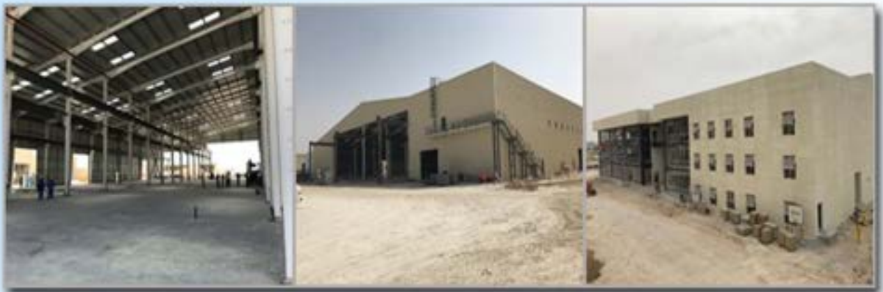
Project: Fabrication, P&M and Painting Workshop and Office Building for QCON Client: Qatar Engineering and Construction Co. WLL Location: Gate no. 6, Ras Laffan Industrial Area