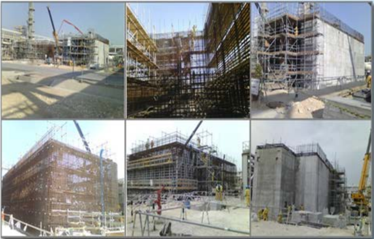
Project: Qatargas Waste Water Treatment Plant EPC Project Client: QatarGas Operating Company Location: Ras Laffan Industrial Area