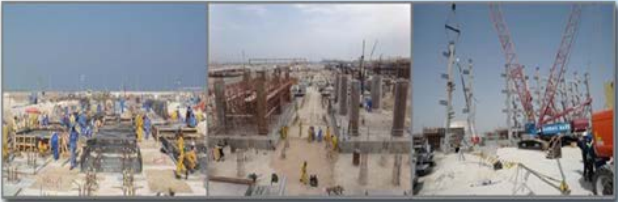
Project: Jetty Boil-off Gas Recovery Project (Off-plot and CCA) Client: QatarGas Operating Company Location: Ras Laffan Industrial Area