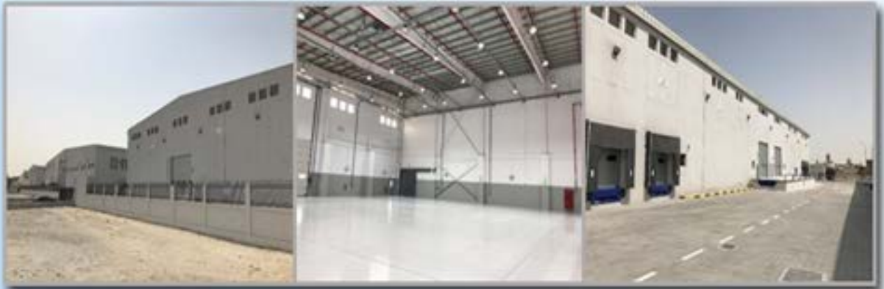
Project: Construction of Proposed Qatar Logistic Buildings at Industrial Area Client: Al-Mannal Cooperation Location: St. 24, Industrial Area