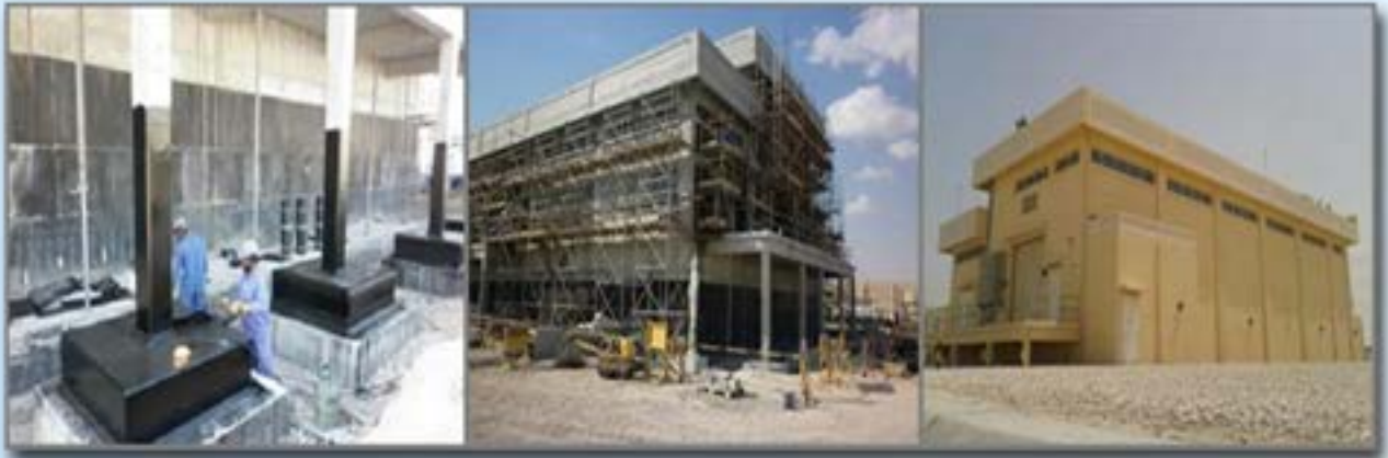
Project: Kharamaa Phase 9 Substations Civil & Building Works for Siemens Client: Kharamaa Location: North Road Substations and Mesaieed Market Substations