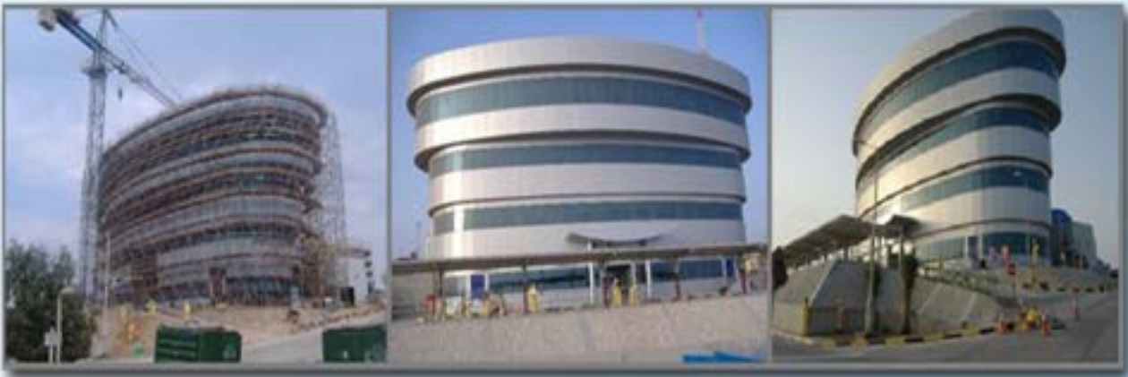
Project: Civil Works for EPIC of New Control Building at Halul Island for QP Client: Qatar Petroleum Location: Halul Island