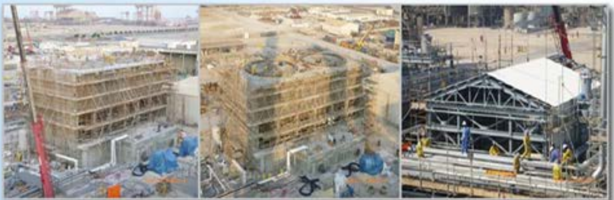
Project: QAFAC CO2 Recovery Project Client: Qatar Fuel Additives Co. Location: Mesaieed Industrial City