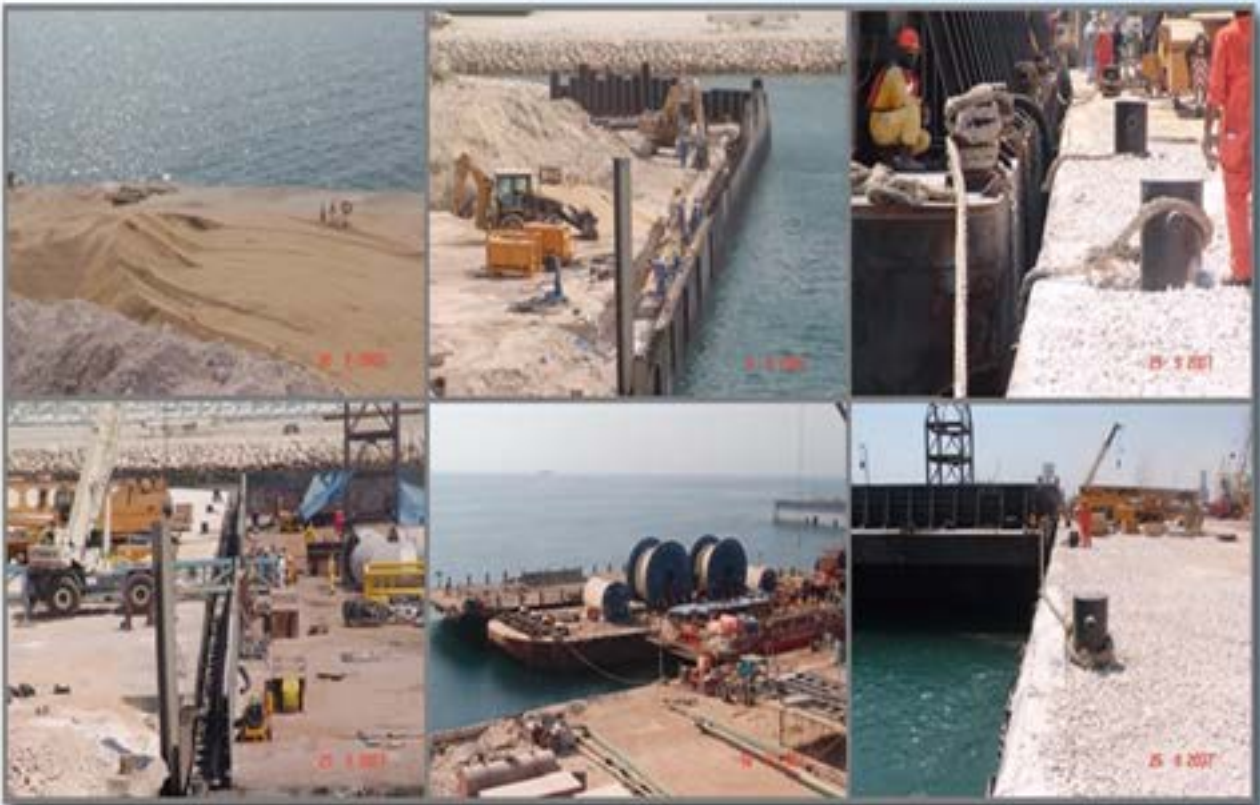
Project: Qcon Marine Yard Jetty Refurbishment Projects Client: Qatar Engineering and Construction Co. WLL Location: Mesaieed Industrial Area