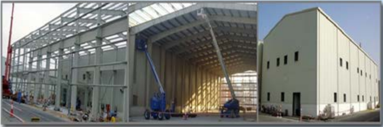
Project: Qatargas Combined Seven Facilities Modifications Project Client: QatarGas Operating Company Location: Ras Laffan Industrial Area