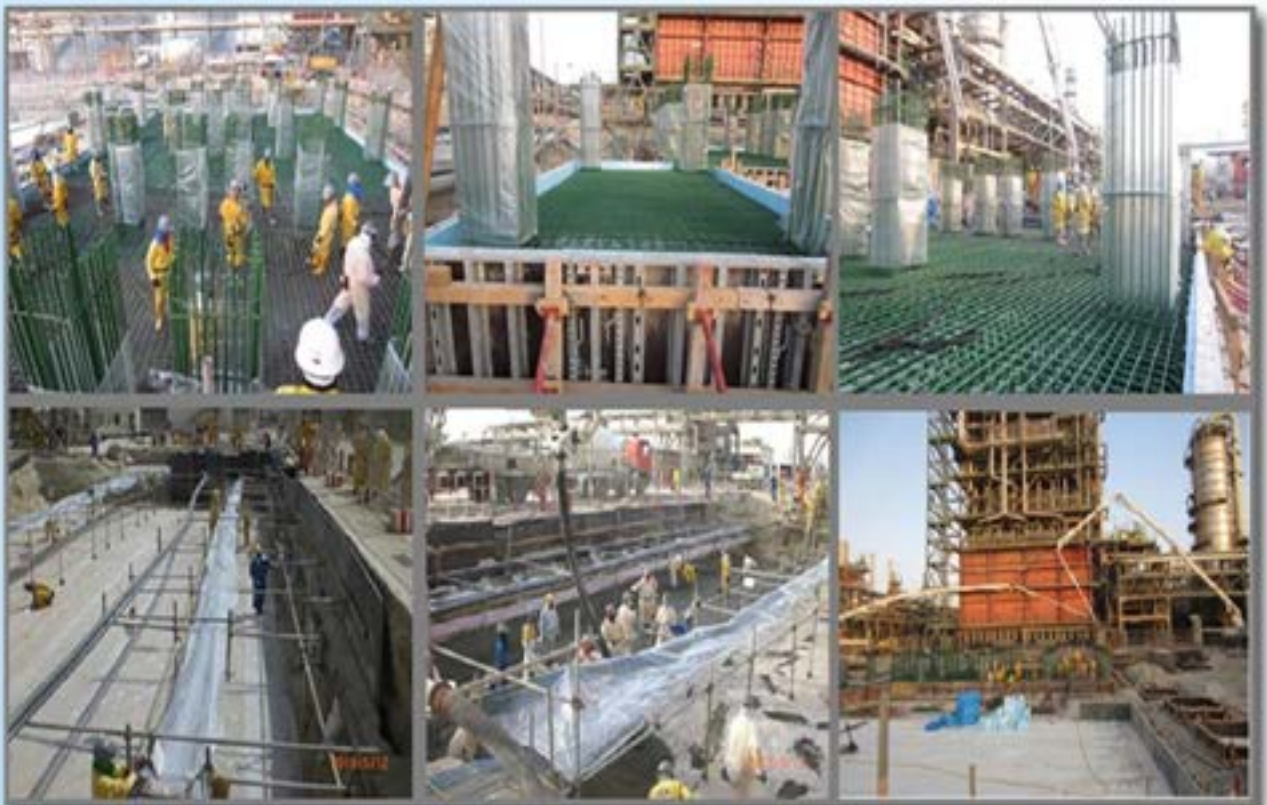
Project: QAPCO EP3 Project (New Furnace and Ethylene Tank) Client: CTCI Overseas Corp Ltd. Location: Mesaieed Industrial Area